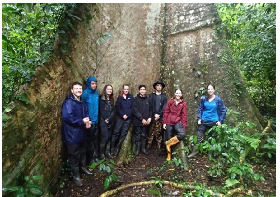
Mosman High students on a school excursion to Borneo