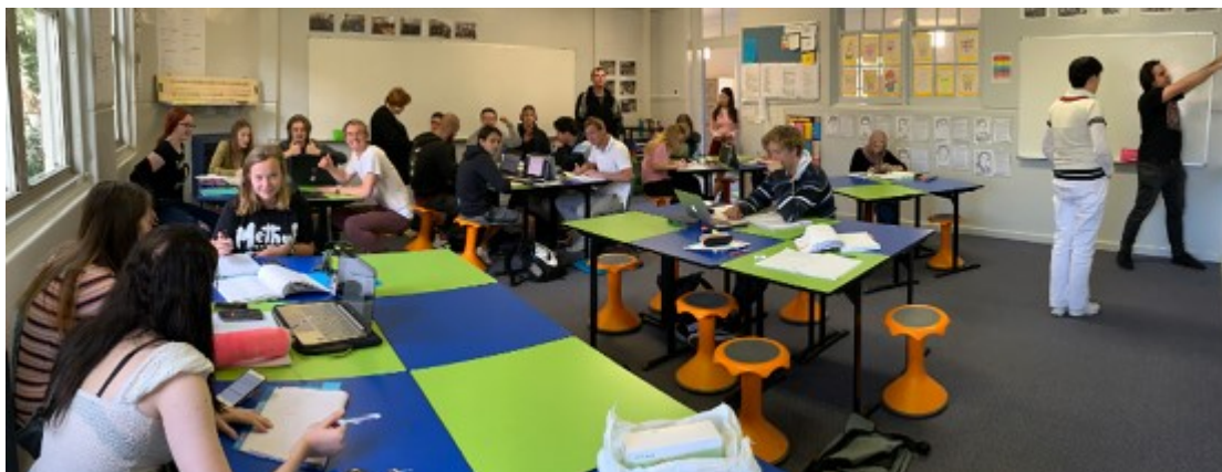
Our maths teachers working alongside our students during the Term 3 school holidays preparing for their HSC exams

Congratulations to our fabulous students and dedicated mathematics faculty for all their hard work!